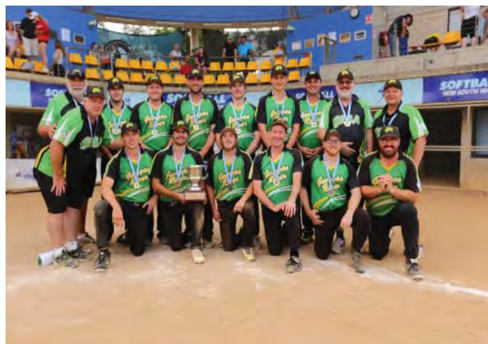
2017 Open State Championship Men