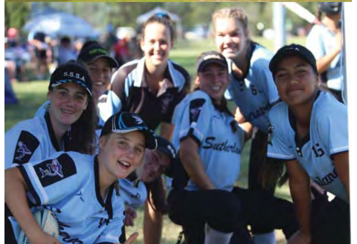
2018 Over 35 State Championship Women