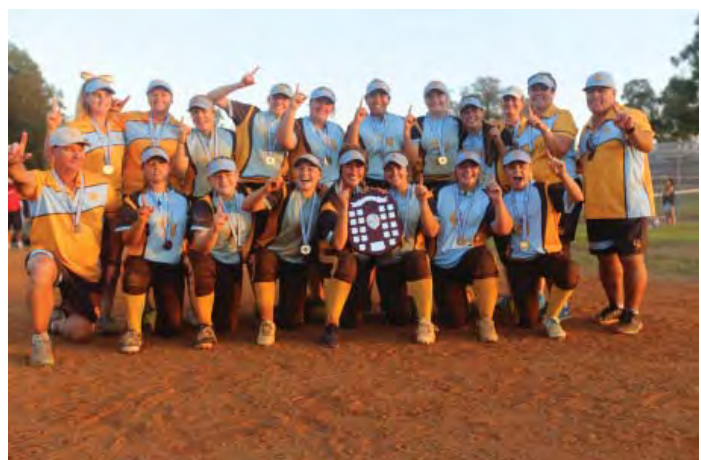
2018 UI7 State Championship Womens