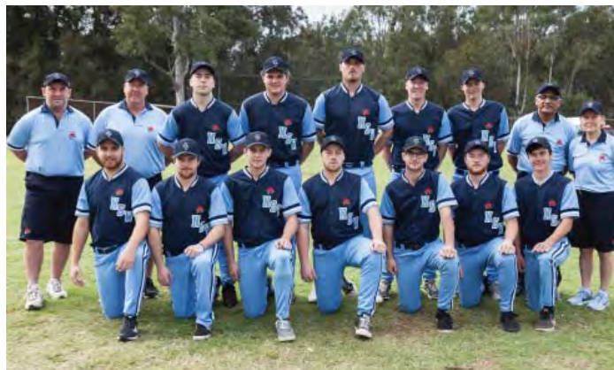
2018 NSW U23 MEN'S TEAM