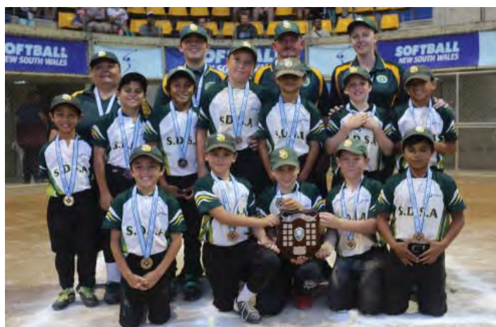
2018 UII State Championship Boys