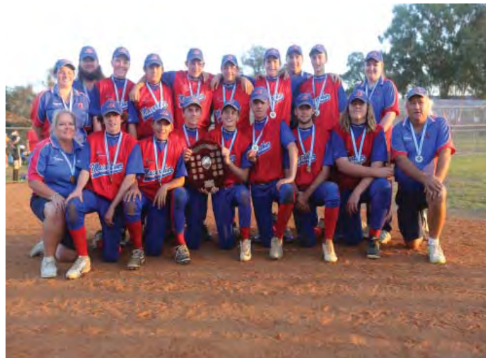
2018 UI7 State Championship Mens