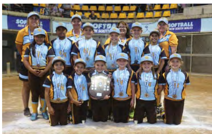
2018 UII State Championship Girls