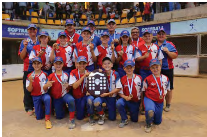
2017 UII State Championship Boys