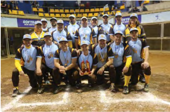
2018 Over 35 State Championship Men