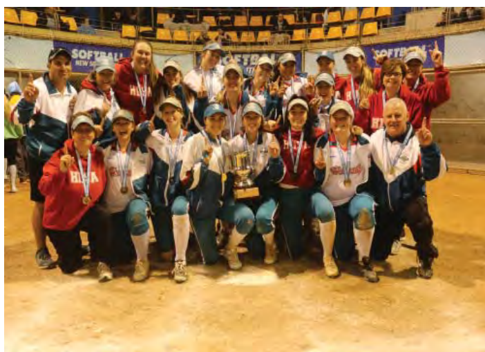
2018 UI9 State Championship Women