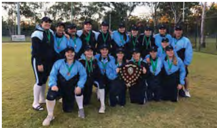
2018 NSW U23 WOMEN'S TEAM