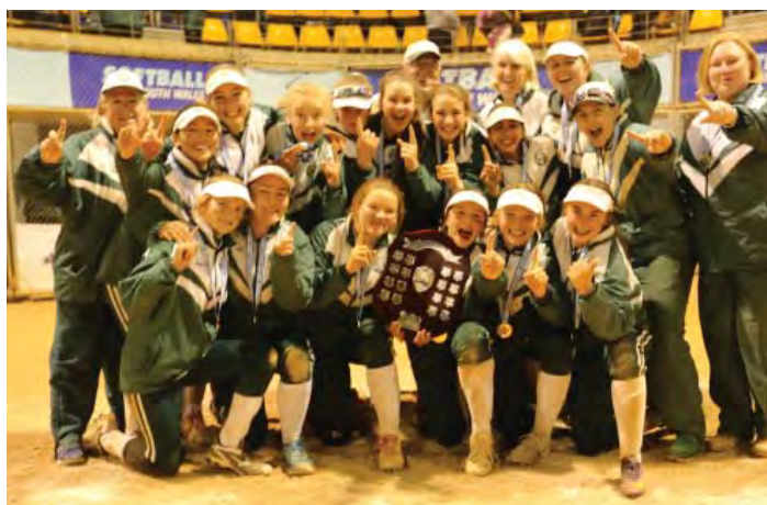
2017 UI5 State Championship Girls