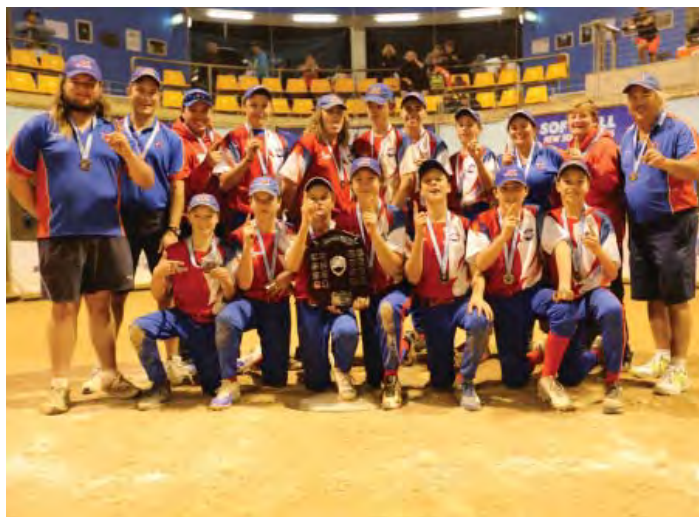
2017 UI5 State Championship Boys