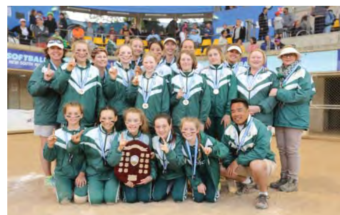
2017 UII State Championship Girls