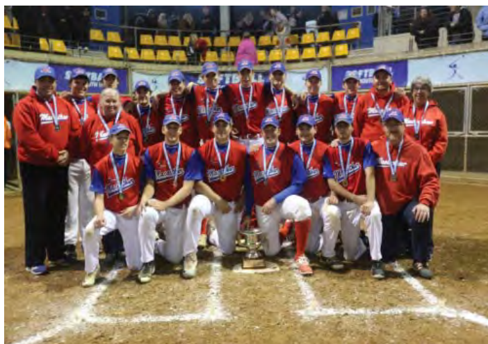
2018 UI9 State Championship Men